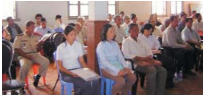
Various stakeholders gather together during presentation of CBMS.

Meanwhile, the provincial partner took part in supervising the enumerators as well as the commune council members. Members of the supervisory team car-